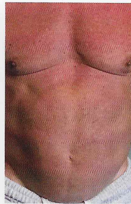
Contour Light Body Contouring before and after

Treatments can be done two to three times a week.